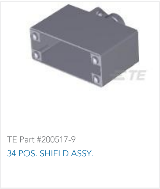
TE Part #200517-9 34 POS. SHIELD ASSY.