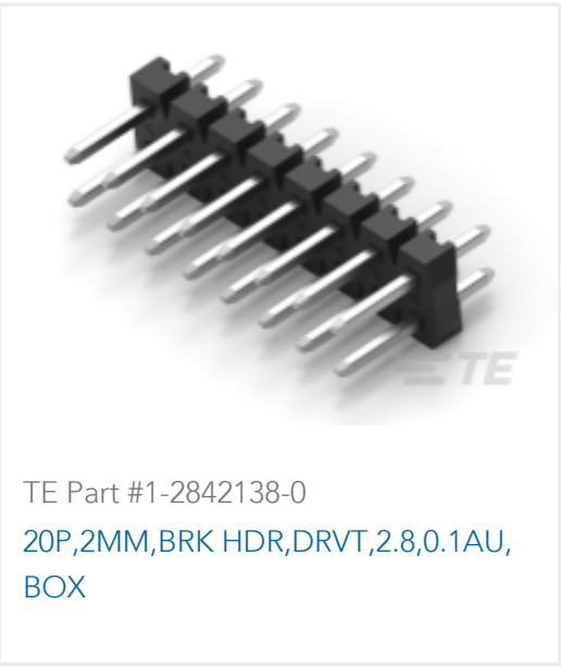
TE Part #1-2842138-0 20P,2MM,BRK HDR,DRV,2.8,0.1AU, BOX