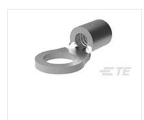
TE Part #34123 TERMINAL, SOLIS R 16-14 10