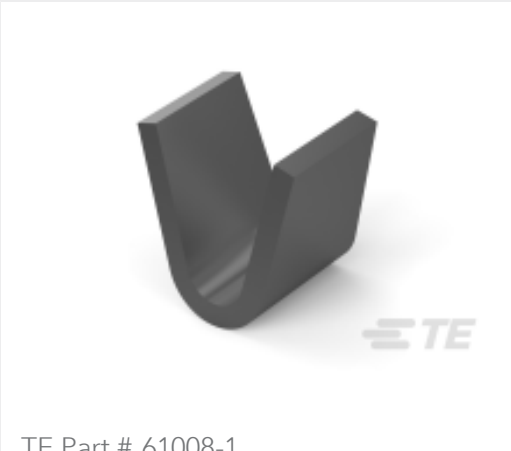
TE Part # 61008-1 SPLICE 18-16 AWG .0158 TPST