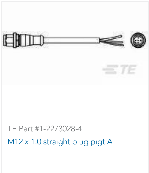
TE Part #1-2273028-4 M12 x 1.0 straight plug pigt A