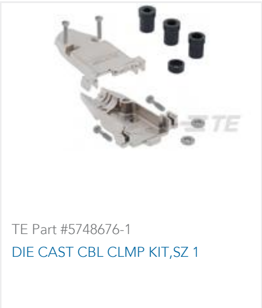
TE Part #5748676-1 DIE CAST CBL CLMP KIT, SZ 1