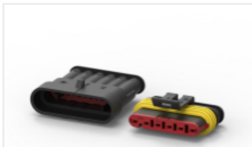
TE Part #CAT-AM71-CH8172 AMP SUPERSEAL 1.5MM, CONNECTOR HOUSING