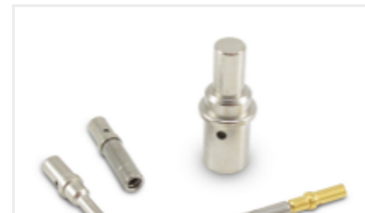
TE Part #CAT-D48-ST273 DEUTSCH Solid Contacts