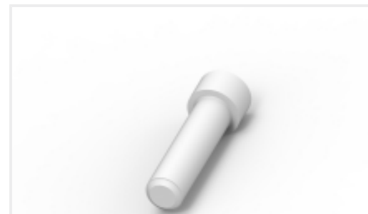
TE Part #114017-ZZ SEALING PLUG, SIZE 12/16, WHT