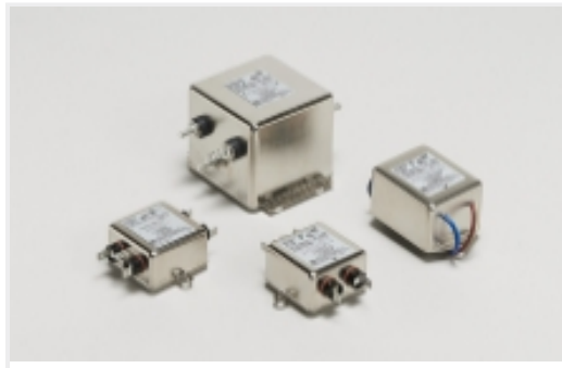
Single Phase Filters(32)