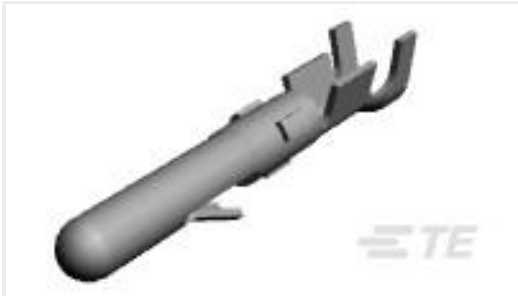
TE Part #61116-4 CMNL PIN 24-18 PTPHBZ