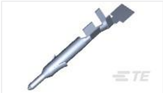
TE Part #1-770901-0 MINI UMNL PIN 26-22 AWG AU LF