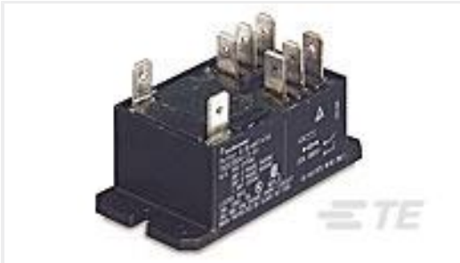
TE Part #1-1393212-7 T92S7D22-24