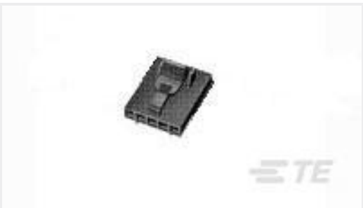
TE Part #104257-1 02 MTE RCPT HSG SR LATCH .100