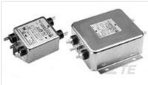
TE Part #6609044-4 20VW1=F7257 S0