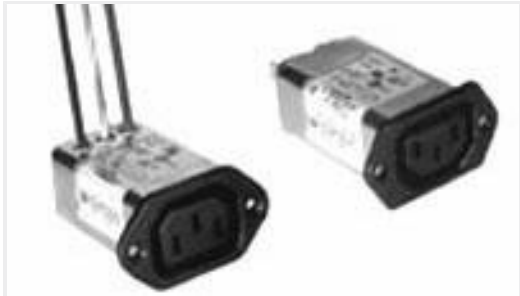
TE Part #6609018-7 10EBF1=F7628 S0