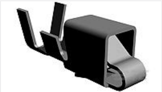
TE Part #1123721-2 ECONOMY POWER CONN REC CONT