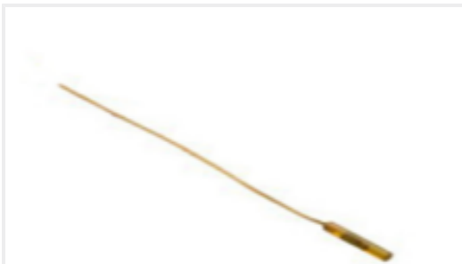
TE Part #GA10K3MCD1 MCD PROBE, 10K OHMS,+/- 0.2C @ 25C