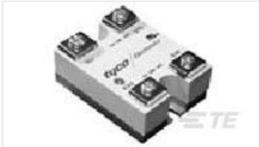
TE Part #1393030-4 SSR-240A25= PANEL MOUNT,25A, 240VAC-AC i/p