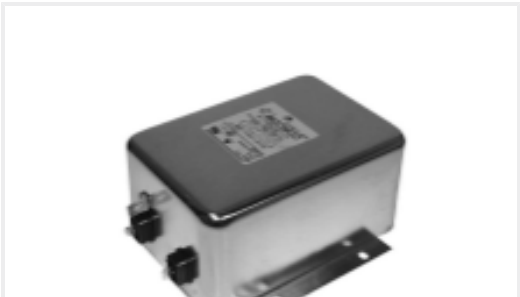
TE Part #CAT-C8114-T1 Single Phase Filters, Corcom T Series