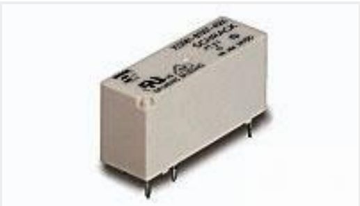
TE Part #1-1416200-0 V23061A1009A302