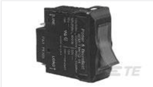
TE Part #1-1393248-1 W33-S1N1Q-5=W33