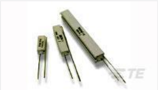
TE Part #1-1623742-0 SBC4 330R 5%