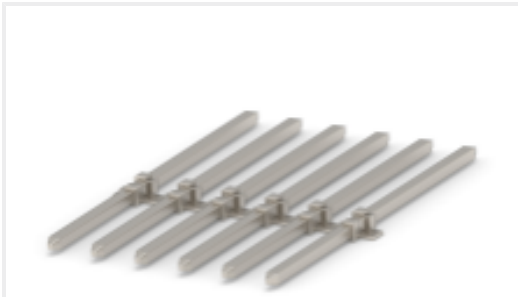
TE Part #2358962-1 MOD II PIN, PRE-TIN PLATED, 21.6mm