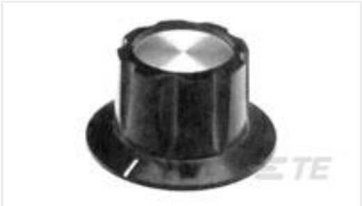
TE Part #2-1437624-3 PKB70B1/4=KNOB PLASTIC W/SKIRT