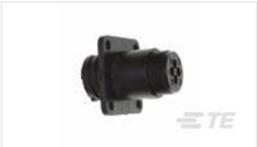
TE Part #206061-1 RECPT, SZ 11-4, CPC