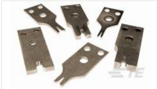
TE Part #5-683453-4 CRIMPER, INSULATION "F"