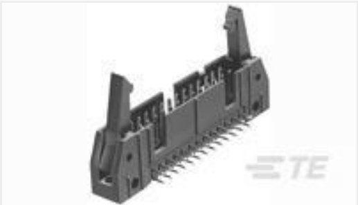
TE Part #1-5499141-2 A/L UNIV HDR 64P RA LAT