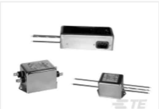
TE Part #CAT-C8114-Q1 Single Phase Filters, Corcom Q Series