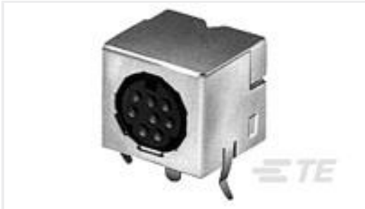
TE Part #5749180-1 Mini DIN, 6 pos, R/A, Shield