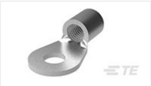
TE Part #8-33465-2 TERMINAL,SOLIS R 6 1/4