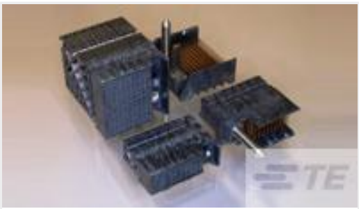
TE Part #2007776-3 IMP100S,H,V3P10C,LG,OEW46,5.5