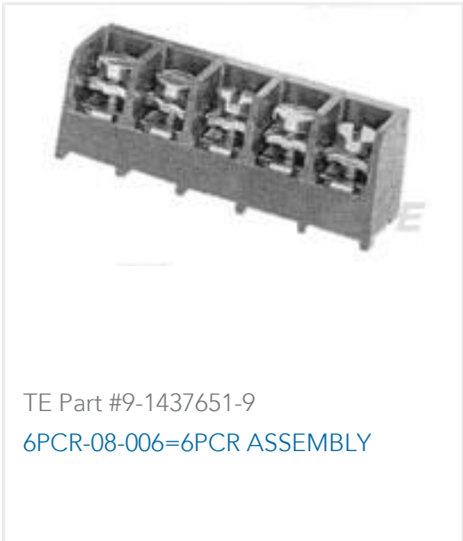
TE Part #9-1437651-9 6PCR-08-006=6PCR ASSEMBLY