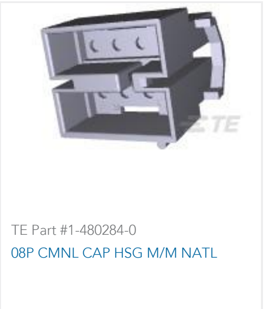
TE Part #1-480284-0 08P CMNL CAP HSG M/M NATL