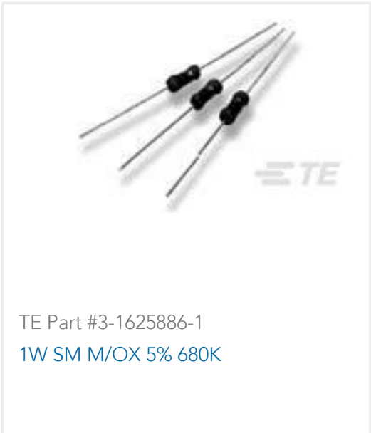
TE Part #3-1625886-1 1W SM M/OX 5% 680K