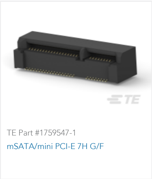
TE Part #1759547-1 mSATA/mini PCI-E 7H G/F