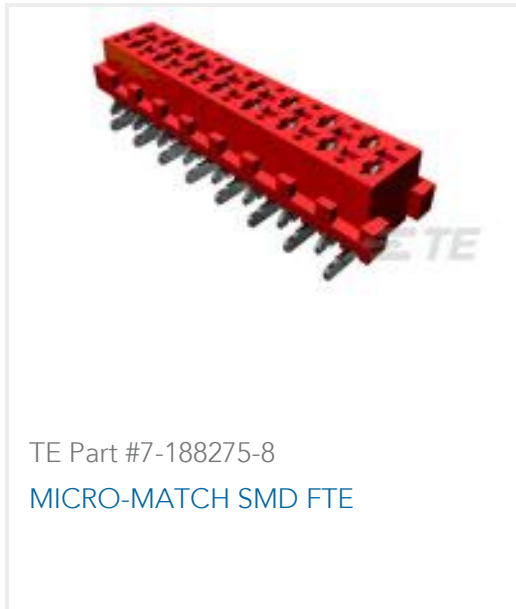
TE Part #7-188275-8 MICRO-MATCH SMD FTE