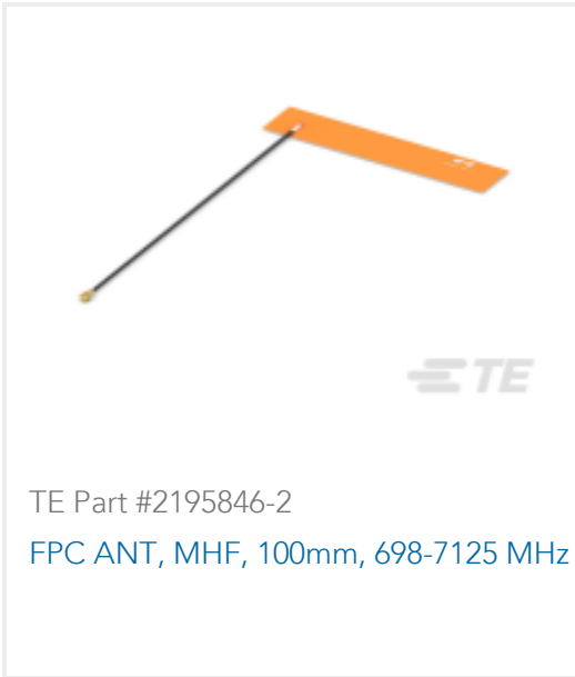
TE Part #2195846-2 FPC ANT, MHF, 100mm, 698-7125 MHz