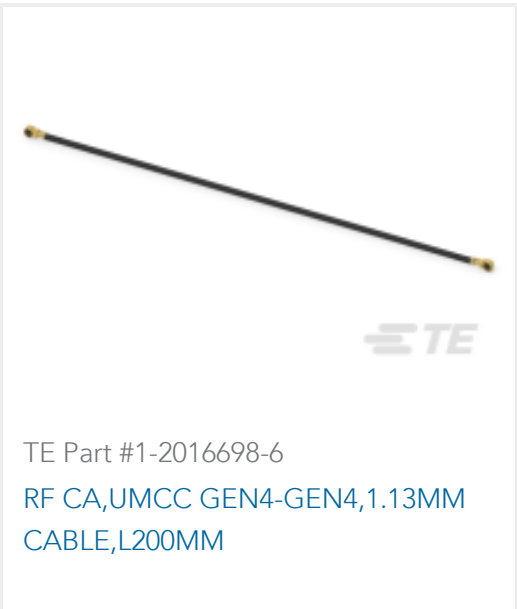
TE Part #1-2016698-6 RF CA,UMCC GEN4-GEN4,1.13MM CABLE,L200MM