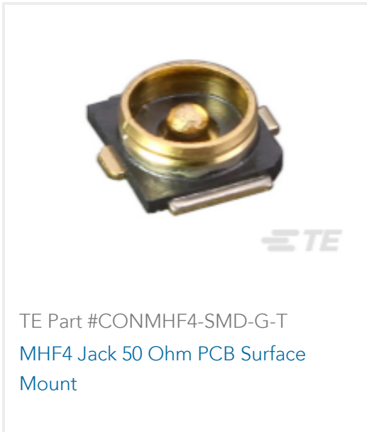
TE Part #CONMHF4-SMD-G-T MHF4 Jack 50 Ohm PCB Surface Mount