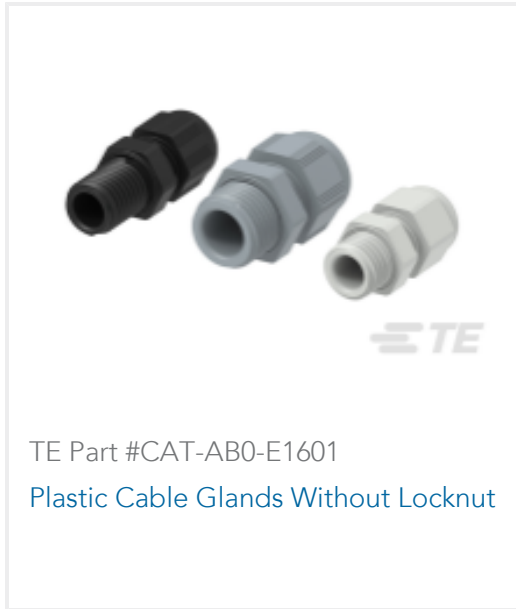
TE Part #CAT-AB0-E1601 Plastic Cable Glands Without Locknut