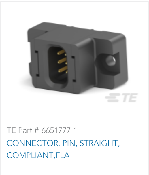
TE Part # 6651777-1 CONNECTOR, PIN, STRAIGHT, COMPLIANT,FLA