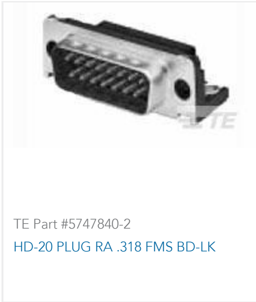
TE Part #5747840-2 HD-20 PLUG RA .318 FMS BD-LK