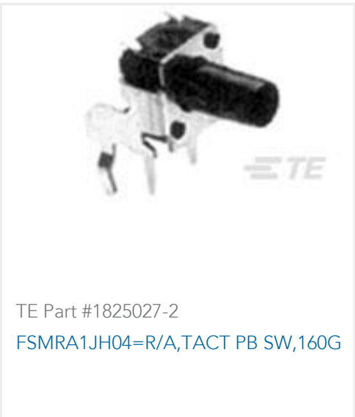
TE Part #1825027-2 FSMRA1JH04=R/A,TACT PB SW,160G

Product Drawings CONNECTOR, SOCKET, STRAIGHT, COMPLIANT, English