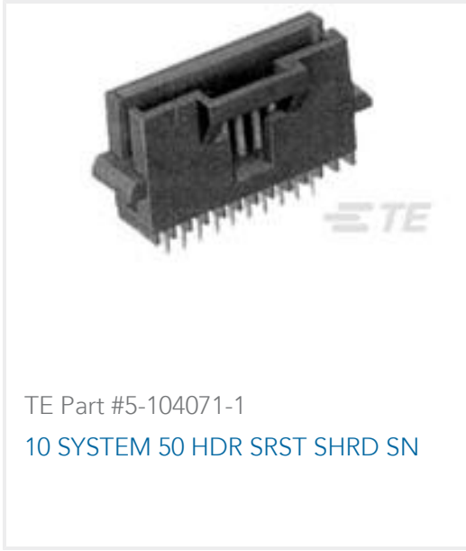
TE Part #5-104071-1 10 SYSTEM 50 HDR SRST SHRD SN