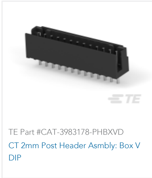
TE Part #CAT-3983178-PHBXVD CT 2mm Post Header Asmbly: Box V DIP