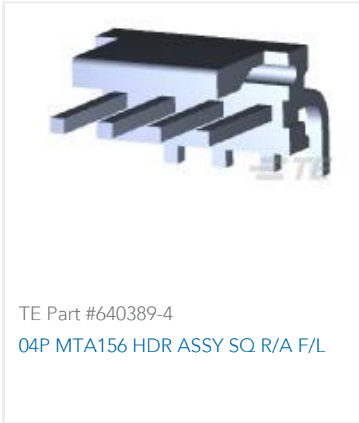
TE Part #640389-4 04P MTA156 HDR ASSY SQ R/A F/L