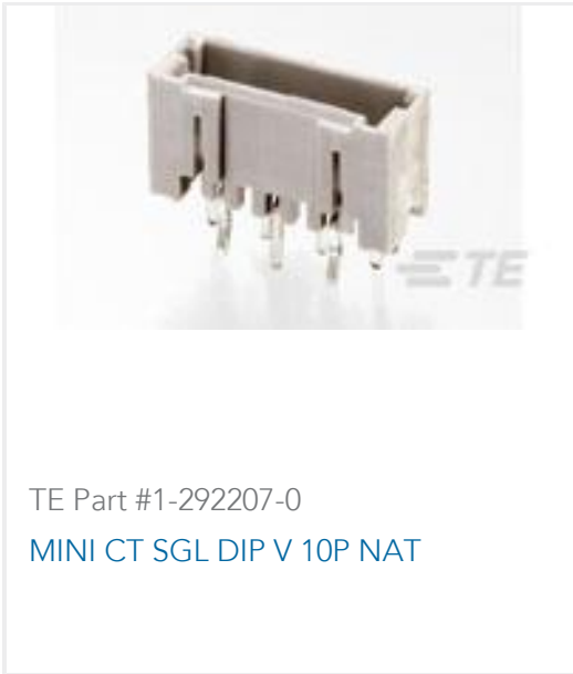
TE Part #1-292207-0 MINI CT SGL DIP V 10P NAT