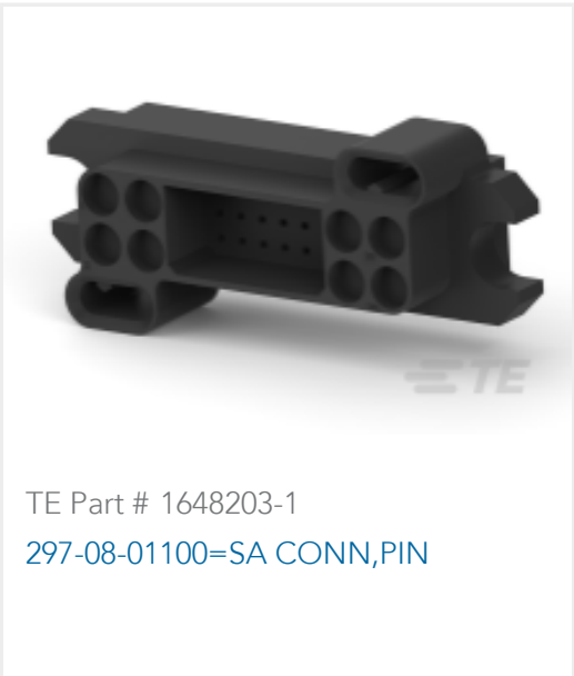
TE Part # 1648203-1 297-08-01100=SA CONN,PIN