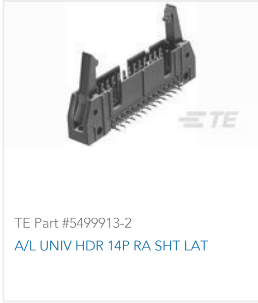
TE Part #5499913-2 A/L UNIV HDR 14P RA SHT LAT