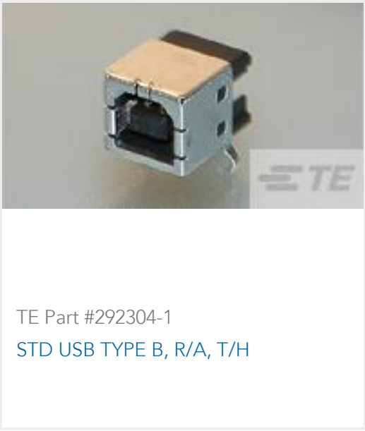
TE Part #292304-1 STD USB TYPE B, R/A, T/H