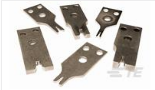
TE Part #1-456402-7 CRIMPER WIRE .055 F