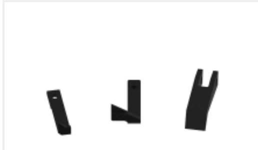
TE Part #1338685-1 FEED PAWL