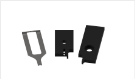
TE Part #2119791-6 Depressor, Wire