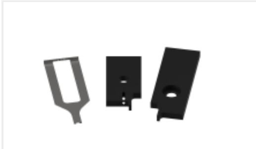
TE Part #1-2119791-2 DEPRESSOR, WIRE