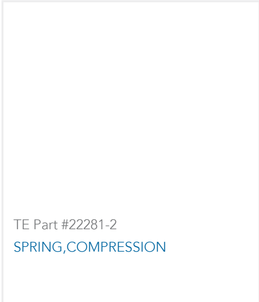
TE Part #22281-2 SPRING,COMPRESSION