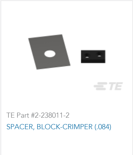
TE Part #2-238011-2 SPACER, BLOCK-CRIMPER (.084)