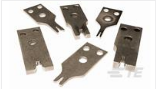
TE Part #4-654223-8 DRAHTCRIMPER