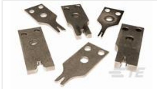
TE Part #453819-3 CRIMPER, WIRE-.062 WIDE F