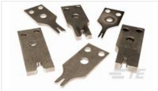
TE Part #1-913714-4 CRIMPER,INS