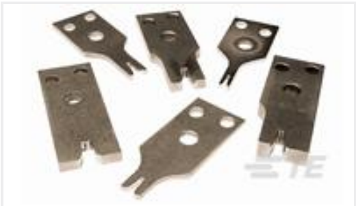
TE Part #1276000-2 CRIMPER,WIRE