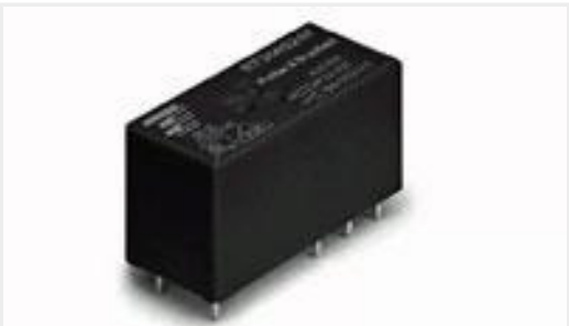
TE Part #2-1393237-3 RT314024F