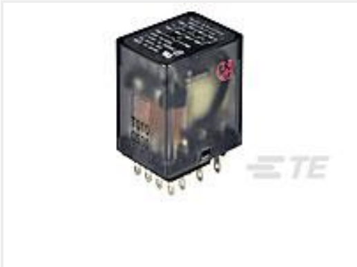
TE Part #3-1393122-2 KHAU-17A12H-120=KH