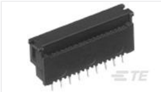
TE Part #487576-4 12 ZIF LINE 50 ASSY