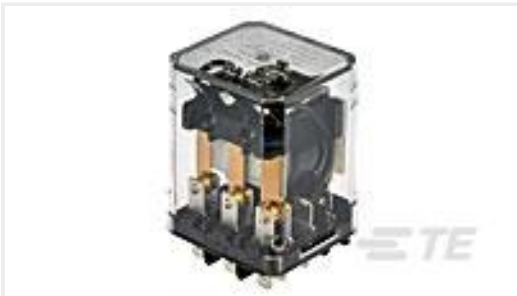
TE Part #7-1393117-8 KUP-14A15-120=KU-