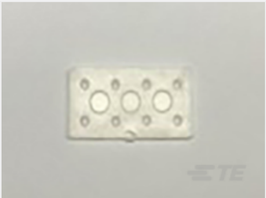
TE Part #4-1617339-6 RP20899G2=ACCESSORY MOUNTING P