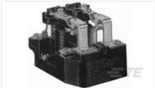
TE Part #1-1393127-6 PRD-11AH0-120=PRD