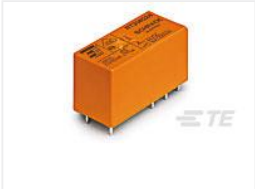
TE Part #1393240-6 RT314615