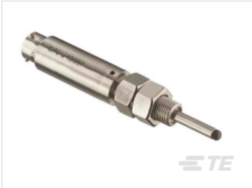
TE Part #02350502-000 GA-HD GCA-121-500 ASSY