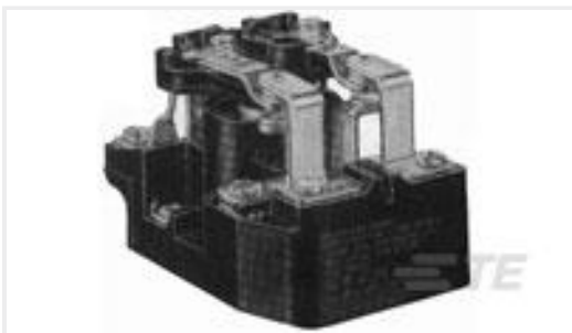
TE Part #8-1393131-0 PRDA-11AYA-24=PRD

Datasheets & Catalog Pages PRD 10 to 50 Amp Heavy Duty AC or DC Power Relay English