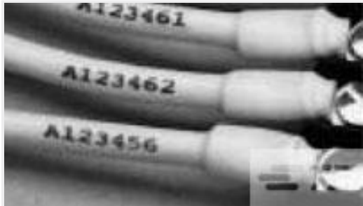
TE Part #5052994173 RNF-100-1/8-BK-SP