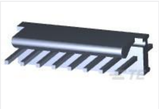
TE Part #3-641126-8 08P MTA100 HDR ASY FL/STR LF