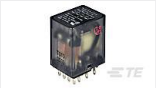
TE Part #2-1393122-8 KHAU-17A12-120=KH