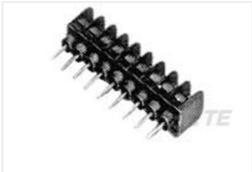
TE Part #1-796988-4 6WWW-02-008=#6 TRIBARRIER TERM