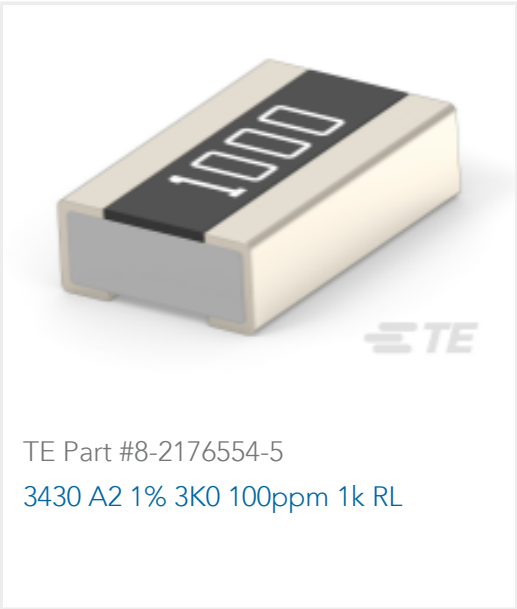
TE Part #8-2176554-5 3430 A2 1% 3K0 100ppm 1k RL