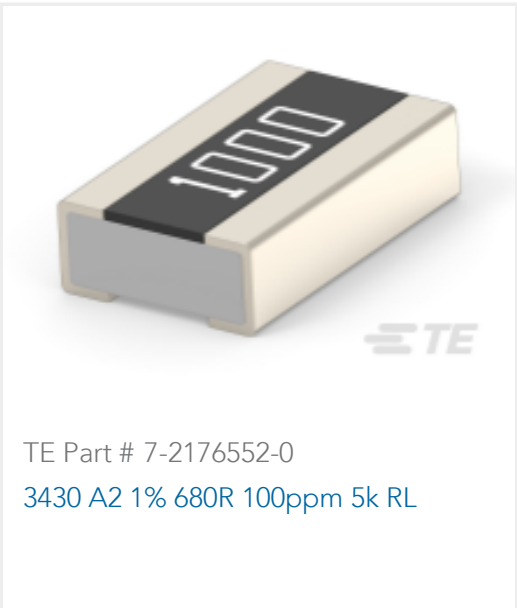
TE Part # 7-2176552-0 3430 A2 1% 680R 100ppm 5k RL