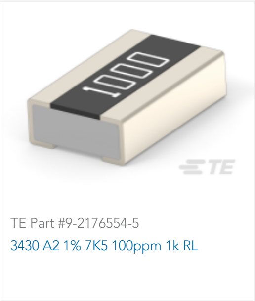
TE Part #9-2176554-5 3430 A2 1% 7K5 100ppm 1k RL