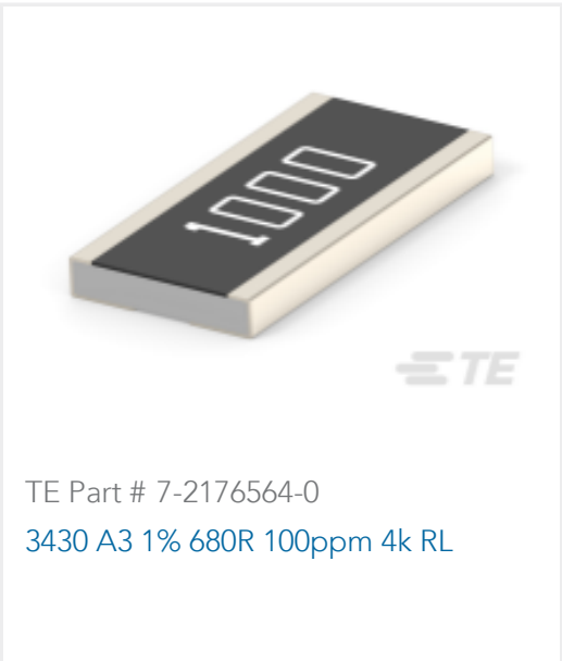
TE Part # 7-2176564-0 3430 A3 1% 680R 100ppm 4k RL