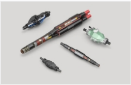
Joints & Splices(24)