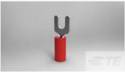
TE Part #2-326861-1 TERMINAL,PIDG SPD 22-16 6