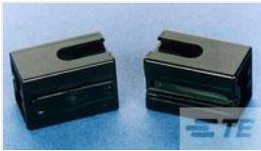
TE Part #557313-1 MOUNTING ADAPTR,AMPINNERGY WTW