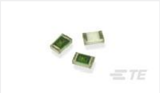
TE Part #1614352-1 RN 0603 20K 0.1% 10PPM 5K RL