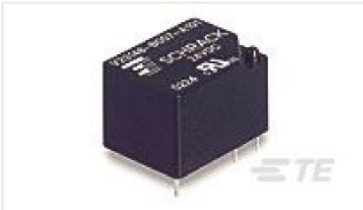
TE Part #2-1393203-8 V23148-A1007-A101