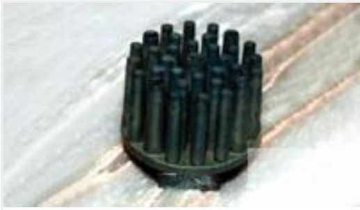
TE Part #1-1542001-2 HTS264NF-D=HS ASSY PPA CLIP