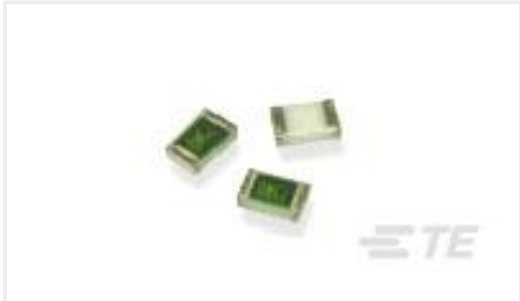
TE Part #1614353-4 RN 0603 2K37 0.1% 10PPM CUT LENGTH