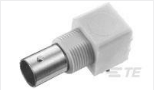
TE Part #5415633-1 RTANG BNC PCB JACK - 75 OHM