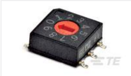
TE Part #1825013-6 MRD10CSTR04=7MM ROT DIP, BCD COMP