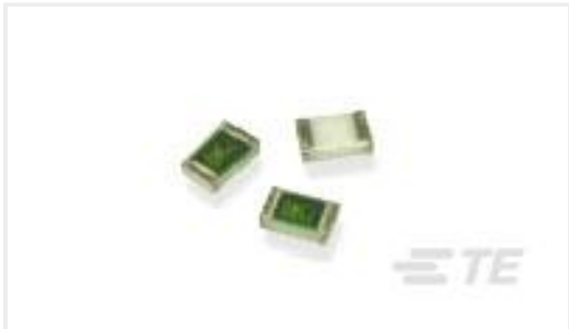
TE Part #1614353-9 RN 0603 2K67 0.1% 10PPM CUT LENGTH