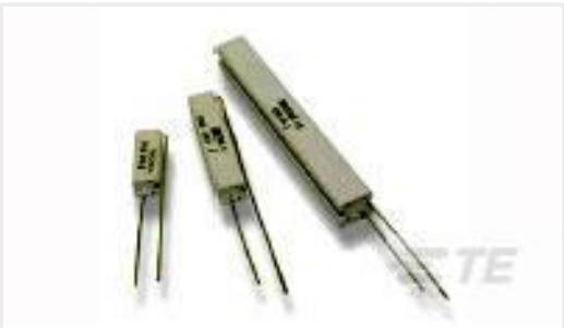
TE Part #1623722-4 SBCH 11 33R 5%