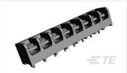
TE Part #1-1437653-3 6PCV-08-006=6PCV ASSEMBLY