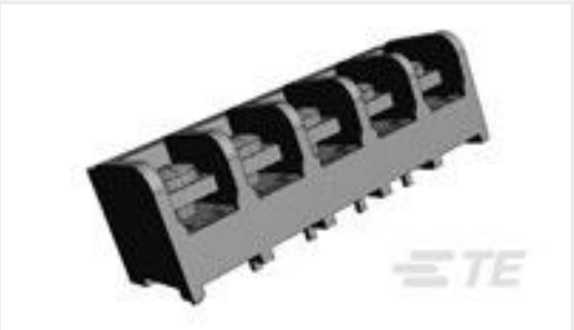
TE Part #8-1437652-2 6PCV-05-006=6PCV ASSEMBLY