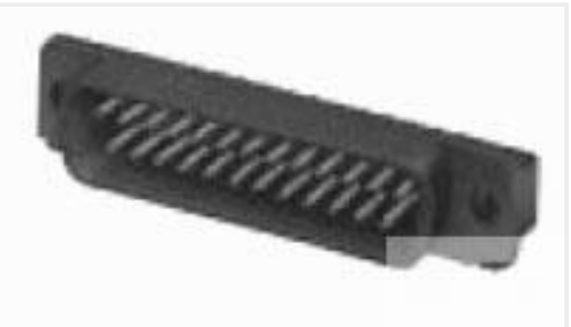
TE Part #5745071-1 HD-20 PLUG 9P VERT FFSCRLK