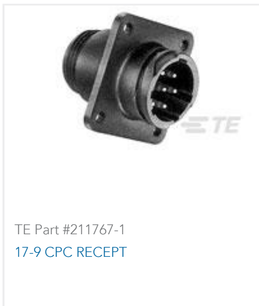
TE Part #211767-1 17-9 CPC RECEPT