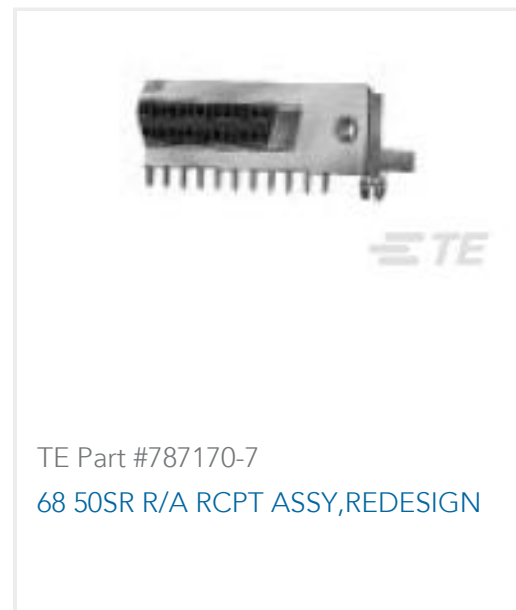
TE Part #787170-7 68 50SR R/A RCPT ASSY, REDESIGN