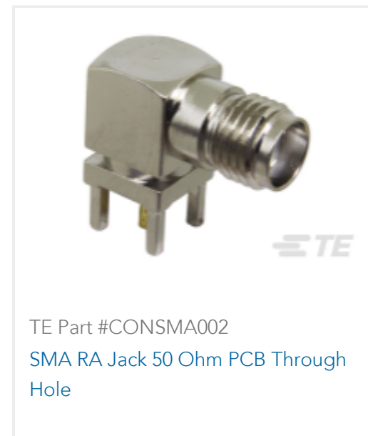
TE Part #CONSMA002 SMA RA Jack 50 Ohm PCB Through Hole