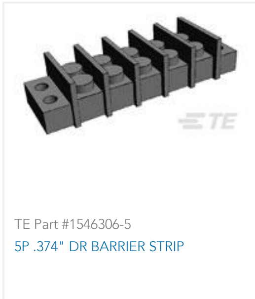
TE Part #1546306-5 5P .374" DR BARRIER STRIP