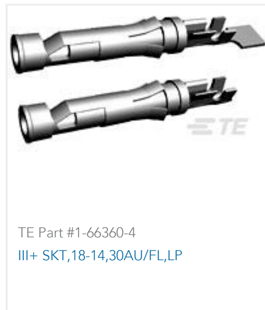
TE Part #1-66360-4 III+ SKT, 18-14, 30AU/FL, LP