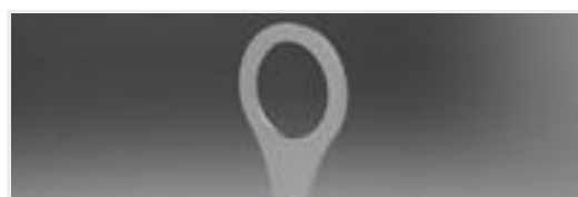
TE Part #320576 TERMINAL,PIDG R 12-10 5/16