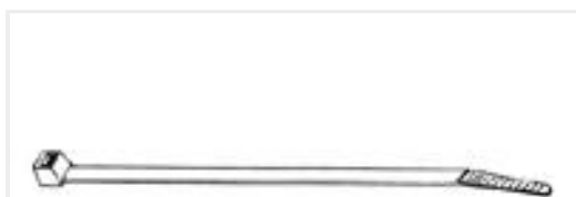
TE Part #1-604771-0 CABLE TIE, 4" BLACK, 100PK