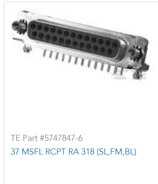
TE Part #5747847-6 37 MSFL RCPT RA 318 (SL, FM, BL)