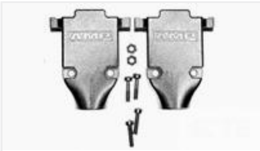
TE Part #5748678-3 2 PC PLST CBL CLMP KIT