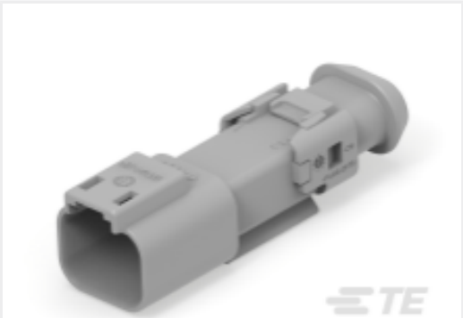
TE Part #2-2303812-1 DT04-2P-TE81, REC, 2P, GRY, E, SNAPXCAP