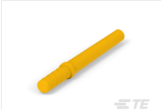
TE Part #0413-214-1205 SEALING PLUG, SIZE 12, KEYING, YEL