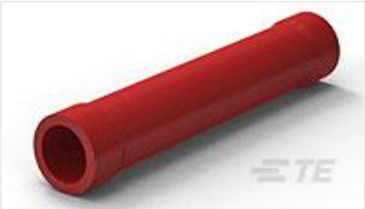
TE Part #8-34070-1 PG BUTT SPLC 22-16COMM22-18MIL