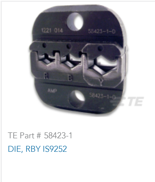
TE Part # 58423-1 DIE, RBY IS9252