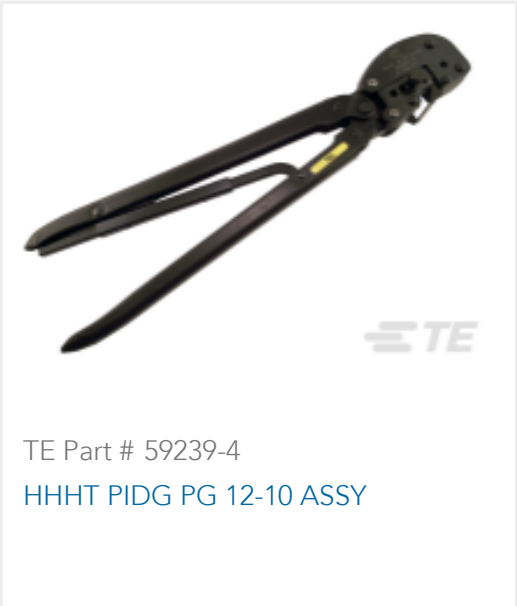
TE Part # 59239-4 HHHT PIDG PG 12-10 ASSY