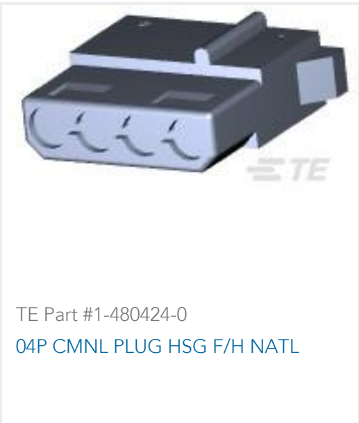
TE Part #1-480424-0 04P CMNL PLUG HSG F/H NATL