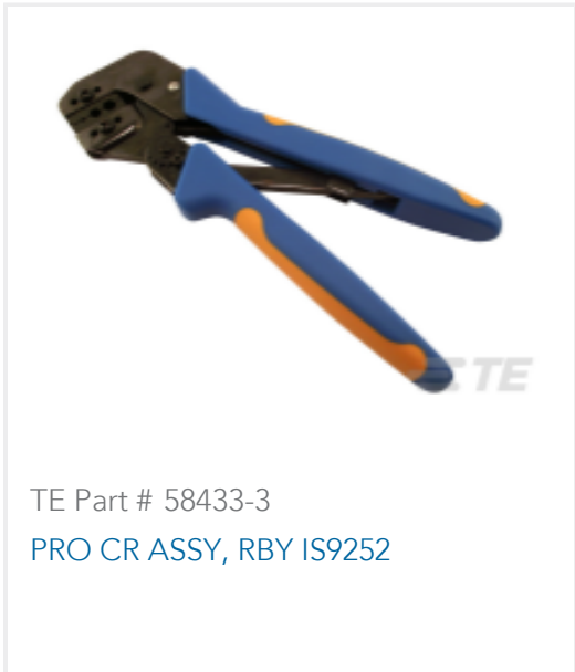
TE Part # 58433-3 PRO CR ASSY, RBY IS9252