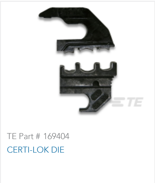
TE Part # 169404 CERTI-LOK DIE