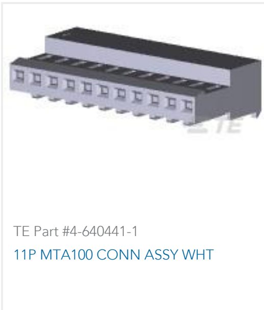
TE Part #4-640441-1 11P MTA100 CONN ASSY WHT