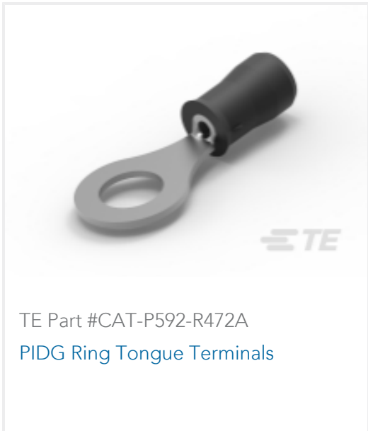
TE Part #CAT-P592-R472A PIDG Ring Tongue Terminals