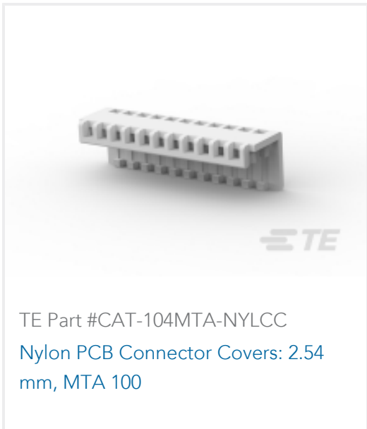
TE Part #CAT-104MTA-NYLCC Nylon PCB Connector Covers: 2.54 mm, MTA 100