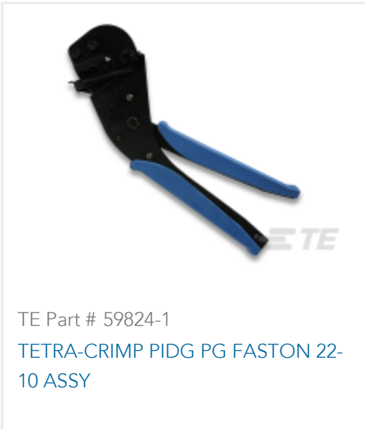
TE Part # 59824-1 TETRA-CRIMP PIDG PG FASTON 22-10 ASSY