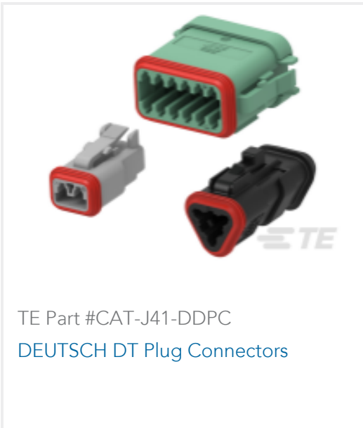
TE Part #CAT-J41-DDPC DEUTSCH DT Plug Connectors