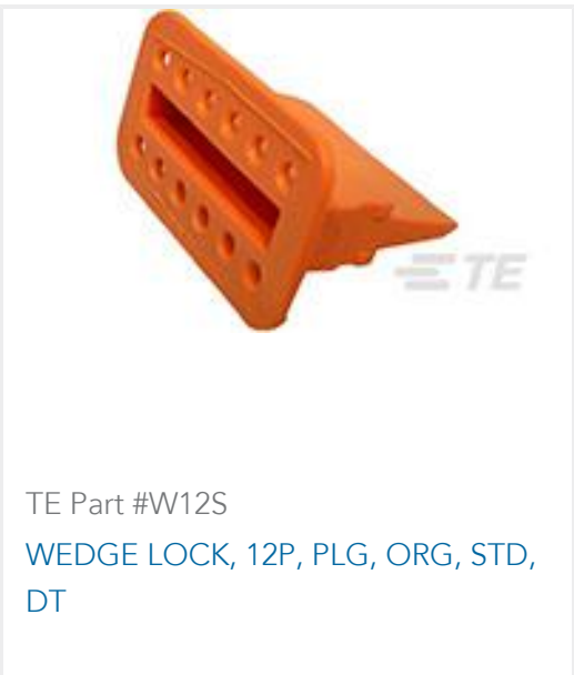
TE Part #W12S WEDGE LOCK, 12P, PLG, ORG, STD, DT