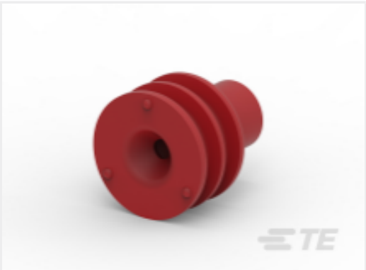
TE Part #1-1437713-2 106100=GROMMET RED