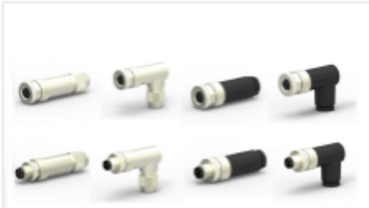
TE Part #CAT-C73765-M1 M8 Field Installable