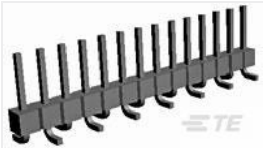
TE Part #1241150-5 5P MOD II BREAK AWAY HDR , SMD, BLISTER