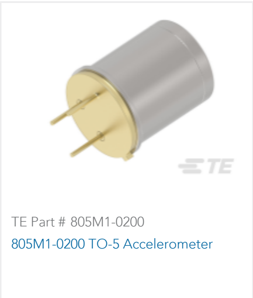
TE Part # 805M1-0200 805M1-0200 TO-5 Accelerometer