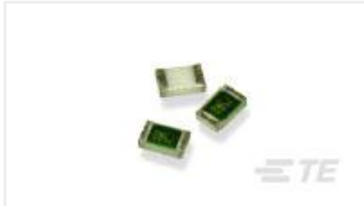
TE Part #6-1614964-3 CPF 1206 150R 0.1% 25PPM 1K RL