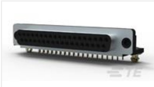
TE Part #5747847-4 37 MSFL RCPT RA 318 (IN,FM,BL)