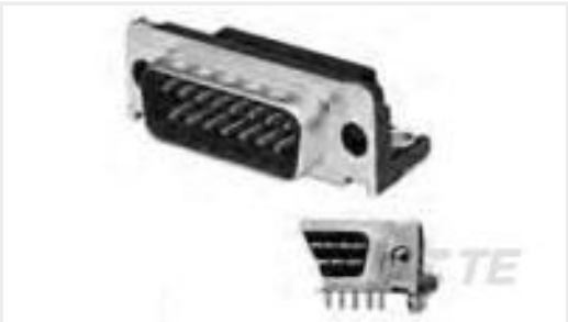
TE Part #5747843-4 37 MSFL PLUG RA 318 (IN,FM,BL)