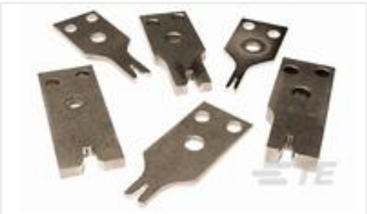
TE Part #1-456405-5 CRIMPER, WIRE .080 "F"