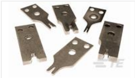
TE Part #1-456403-3 CRIMPER WIRE .062 F