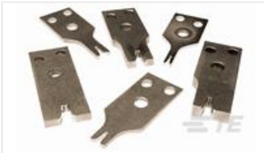
TE Part #1633965-1 CRIMPER, INSUL O PREMIUM