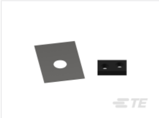
TE Part #690753-2 SPACER, TONKER