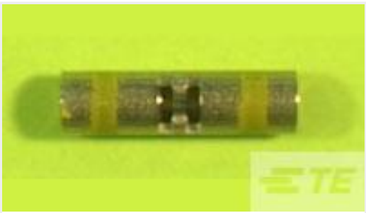
TE Part #680326-000 D-609-06