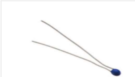
TE Part #GA50K6A1A DISCRETE 50K OHMS, +/-0.1C FROM 0C TO 70C