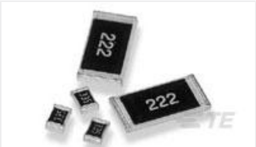
TE Part #3-1879501-1 CRGH2512 5% 18R 2W