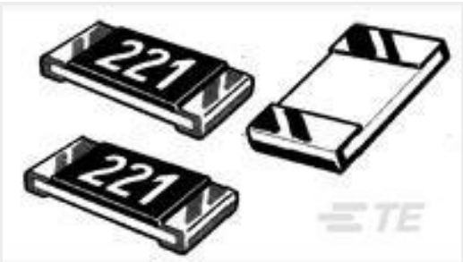
TE Part #1-2176230-1 3522 5R6 5% 3W