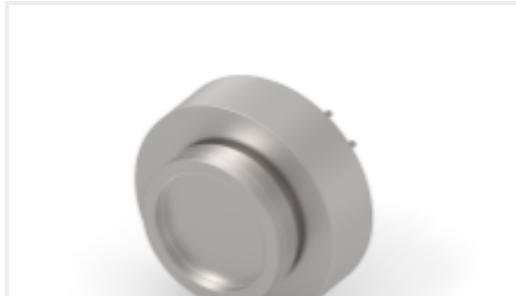
TE Part #CAT-MIPS0044 MV Pressure Sensor, Uncalibrated, 87NU