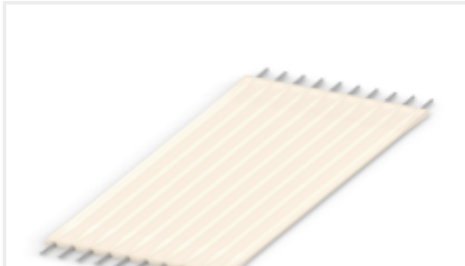
TE Part #6-6437158-0 FSN-21.5A