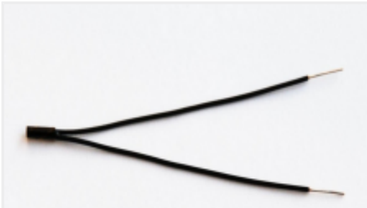
TE Part #GA10K3MBD1 MBD PROBE, 10K @25C, 0.2 FROM 0 TO 70