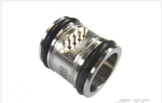
TE Part #DP86-500D 500 PSID MV DIFFERENTIAL PRESSURE SENSOR