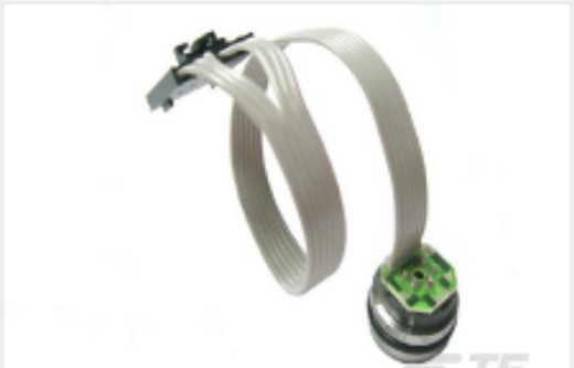
TE Part #86-050A-R 50 PSIA RIBBON CABLE MV PRESSURE SENSOR