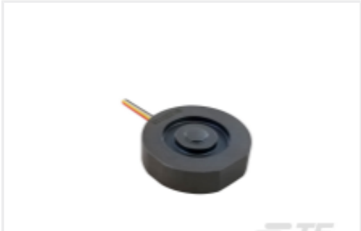
TE Part #20009605-11 FX293X-040B-0100-L