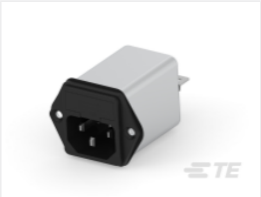
TE Part #806059-SF FN9260-10-06