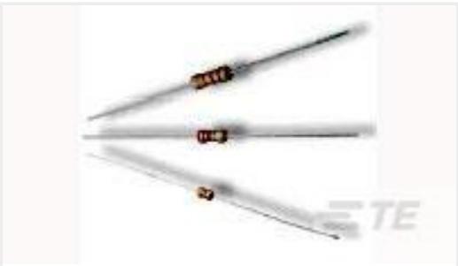
TE Part #1-1623933-6 CFR50 5% 3K0