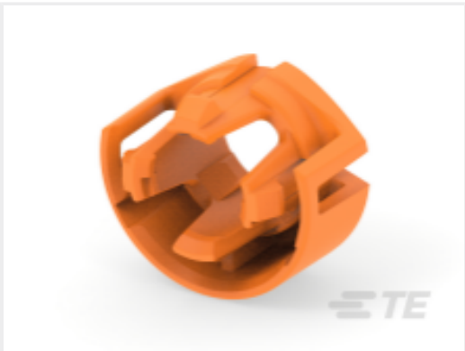
TE Part #2371245-3 SOC CONN CVR,3POS,DIA 4MM,ICT CVE