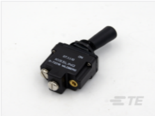
TE Part #K2015512 Toggle Switch 07-1-1-10