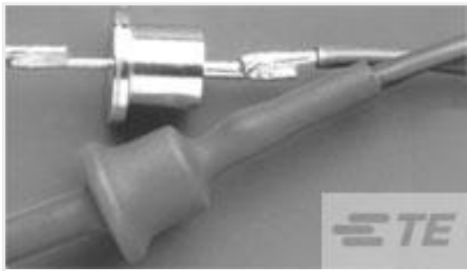
TE Part #5677614009 RNF-3000-39/13-0-SP