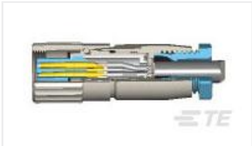
TE Part #3-1437719-0 T01-0550-S03-FEMALE PLUG CONNECTOR SOLDE