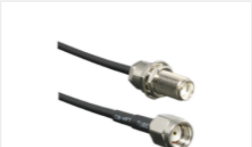
TE Part #CSA-RPSM-216-SAFB SMA to RP-SMA 216mm RG174