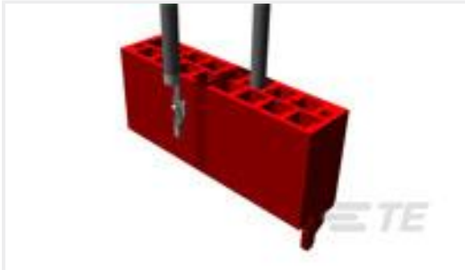
TE Part #1-338095-2 MICRO-MATCH COSIHSG