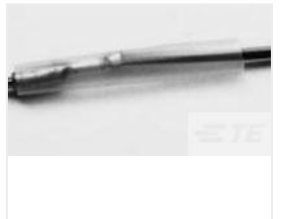
TE Part #CV20922001 RW-175-E-3/64-X-STK