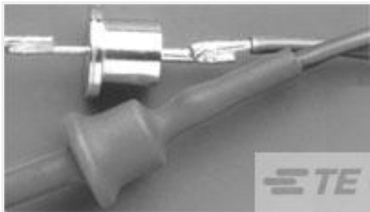
TE Part #5677564008 RNF-3000-3/1-0-SP