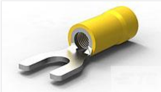
TE Part #34176 TERMINAL,PG SPD 12-10 10