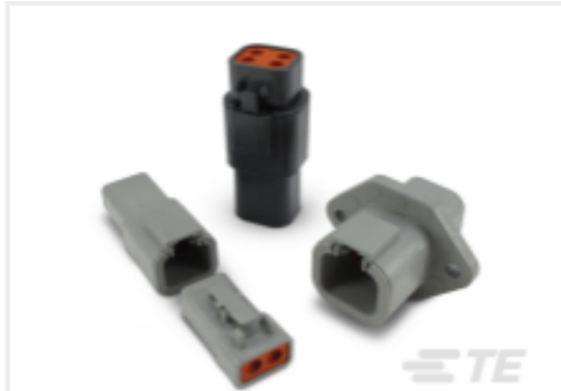
TE Part #CAT-D486-CH8172 DEUTSCH DTP Housings