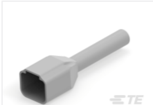
TE Part #DTP4P-BT BOOT, 4P, REC, ST, GRY