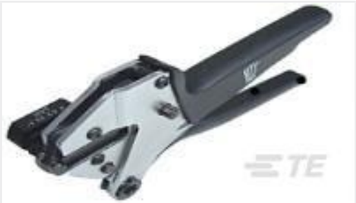
TE Part #539744-2 DIE F2,8FF TAB