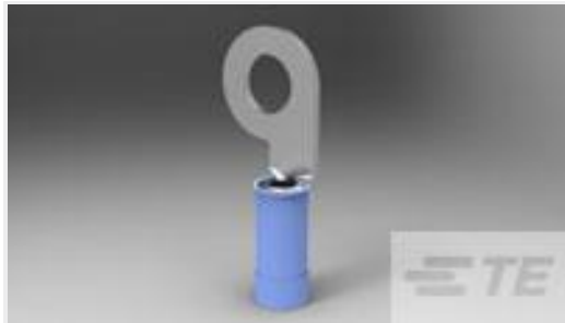
TE Part #323818 TERMINAL,PIDG R OFS 16-14 10