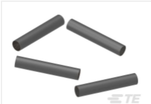
TE Part #NB25842001 SCL-3/8-0-STK