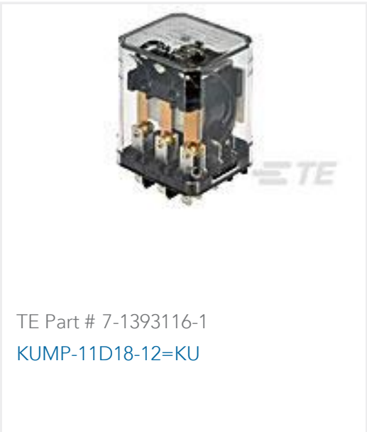
TE Part # 7-1393116-1 KUMP-11D18-12=KU