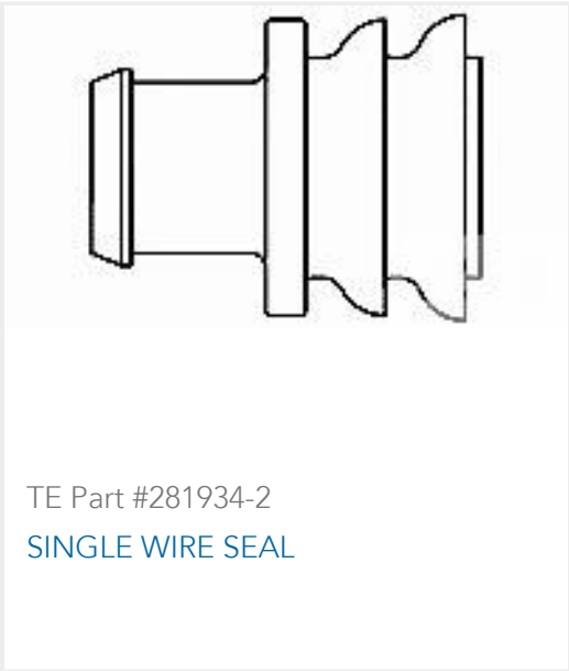
TE Part #281934-2 SINGLE WIRE SEAL