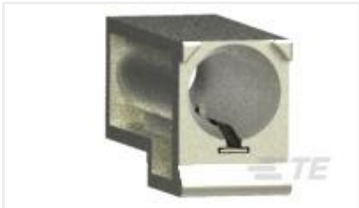
TE Part #1-1469492-9 MULTIGIG RT 9MM GUIDE/ESD UNKE