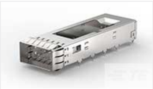
TE Part #2170703-6 CAGE ASSEMBLY, QSFP28 1X1, SPRING