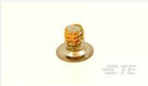
TE Part #1410946-1 MULTI-GIG SOC. CAP SCREW, CUSTOMIZED HDW