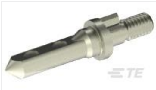
TE Part #1-1469491-3 MULTIGIG RT GUIDE PIN, 9MM 4.20