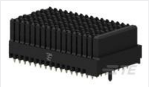
TE Part #1410142-1 MULTIGIG RT T2 .8" BP FULL RGH