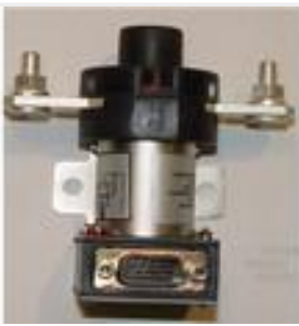
TE Part #1616068-4 K300A5C6=CONTACTOR