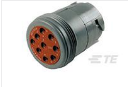
TE Part #HD14-9-96P REC, 9P, GRY, N, THRD, 16 DT