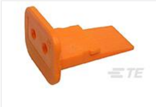
TE Part #W2S WEDGE LOCK, 2P, PLG, ORG, STD, DT