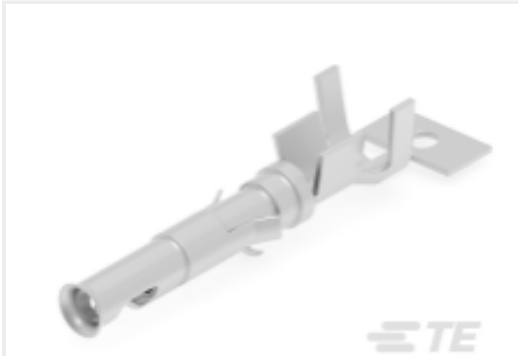
TE Part #827040-1 WITH SPRING