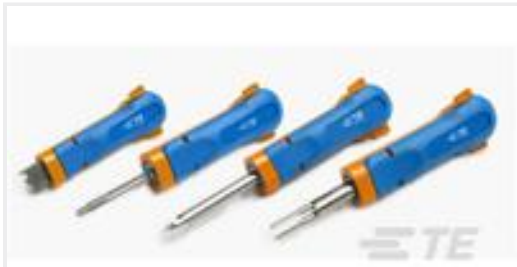
TE Part #539972-1 EXTRACTION TOOL