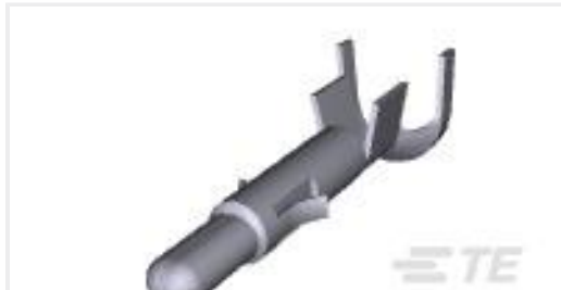
TE Part #926899-1 TERM MACHO UNIVER.MATE-N-LOK