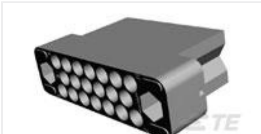
TE Part #201356-3 MALE BLOCK 20 PL. MIN. RECT.