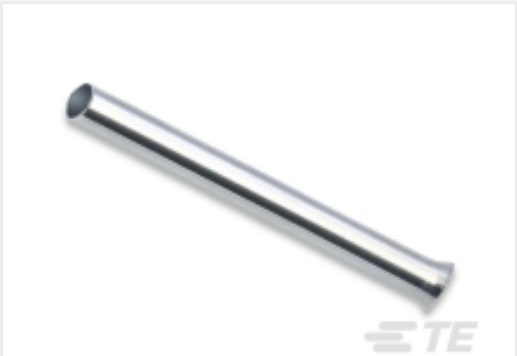
TE Part #5-1579007-0 TUBE