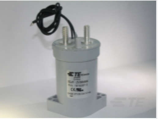
TE Part # 7-1618387-1 LEV200A5ANA=RELAY, SPST-NO