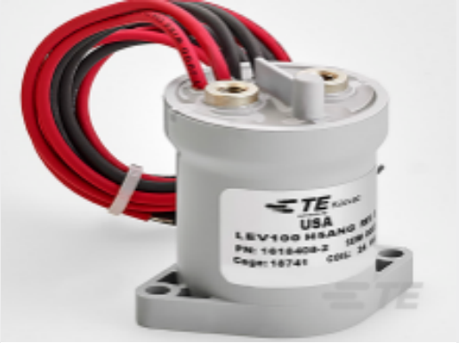
TE Part # 9-1618407-9 LEV100H5CNH=CONTACTOR WITH AUX, SPST