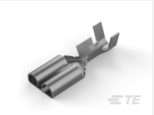
TE Part #170032-6 250 FASTON,REC.,20-14 AWG,TPBR