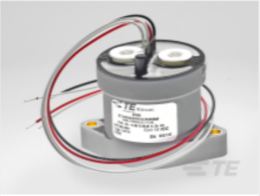
TE Part # 4-1618413-9 EV600HSANM = CONTACTOR, SPST-NO 24V COIL