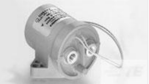
TE Part # 4-1618391-1 LEV100A5ANH=RELAY,SPST-NO 24VDC VMT 15