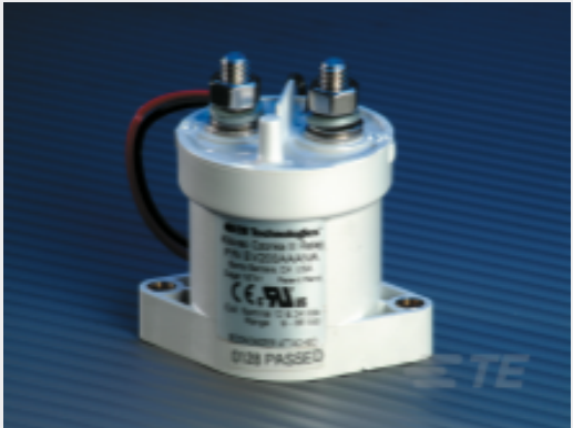
TE Part # 4-1618387-1 EV200HRANA=RELAY, SPST-NO