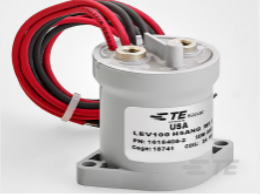
TE Part # 1618408-2 LEV100H5CNG = CONTACTOR WITH AUX SPST