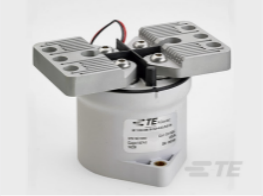
TE Part # CAT-DC-K1K-CONT SPST: Kilovac K1K DC Contactors; Bi-directional Switching