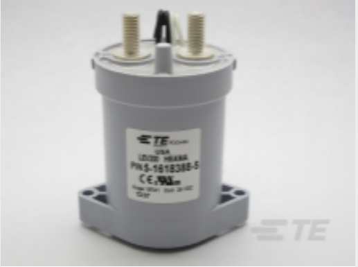
TE Part # 5-1618388-5 LEV200H5ANA=RELAY, SPST-NO