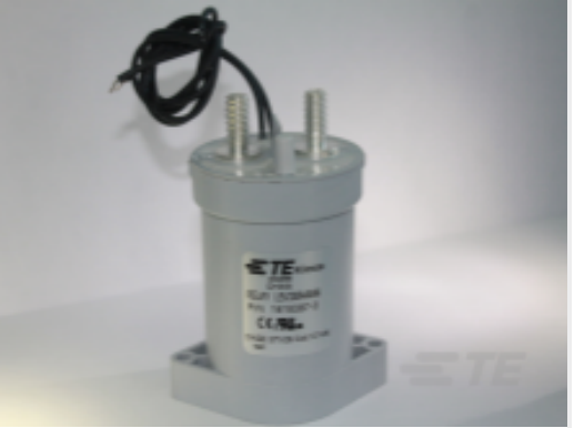
TE Part # 4-1618388-6 LEV200A5NAA=RELAY, SPST-NO