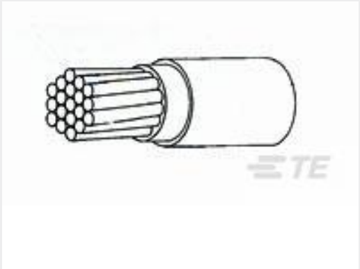
TE Part #282217-000 81044/12-20-6