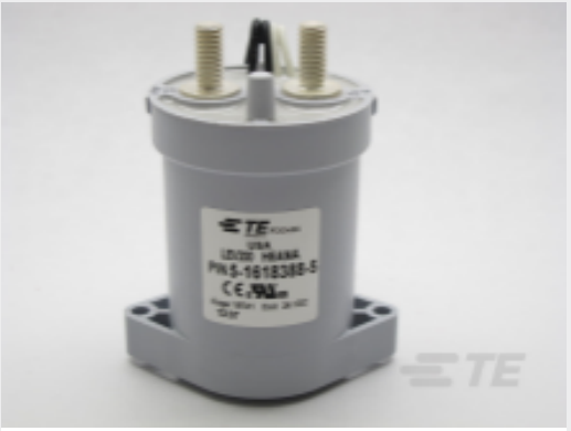
TE Part # 6-1618388-7 LEV200H5ANF=RELAY, SPST-NO