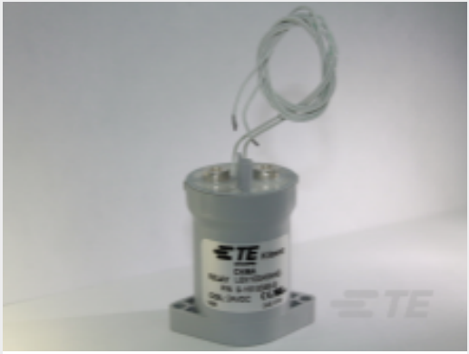
TE Part # 6-1618400-4 LEV100A7ANG=RELAY, 28Vdc SPST-NO