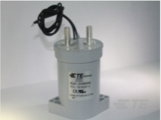
TE Part # 5-1618387-7 LEV200A5NAF=RELAY, 24Vdc SPST NO