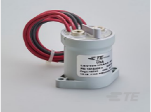
TE Part # 1618412-8 LEV100H5ANG=CONTACTOR WITH AUX SPST,15"