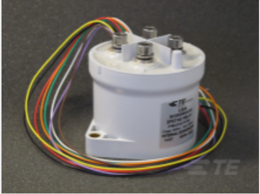
TE Part # 8-1618406-3 EV202ASAND=Relay, DPST-NO 28V