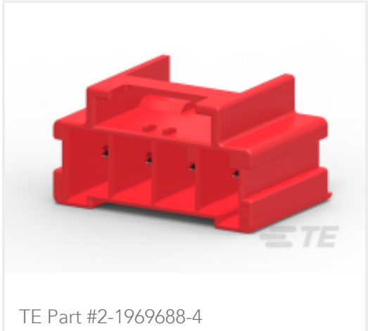
PTL 1X4 PCB HEADER VERT HITEMP KEY B RED