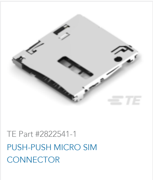
TE Part #2822541-1 PUSH-PUSH MICRO SIM CONNECTOR