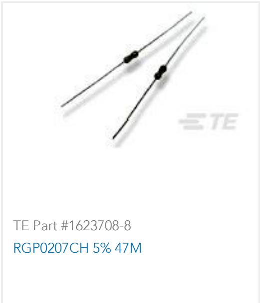
TE Part #1623708-8 RGP0207CH 5% 47M