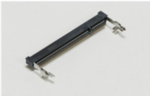
SO DIMM Sockets(39)