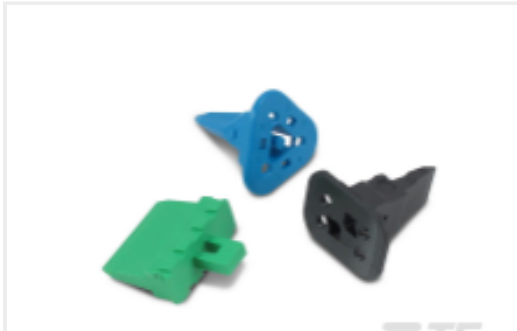
TE Part #CAT-D487-W416 WedgeLocks: DEUTSCH DT