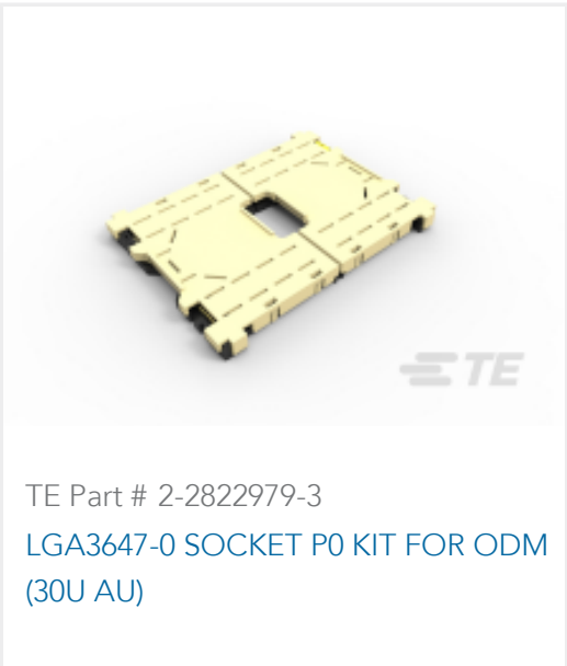
TE Part # 2-2822979-3 LGA3647-0 SOCKET P0 KIT FOR ODM (30U AU)