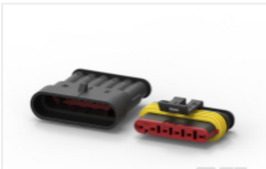
TE Part #CAT-AM71-CH8172 AMP SUPERSEAL 1.5MM, CONNECTOR HOUSING