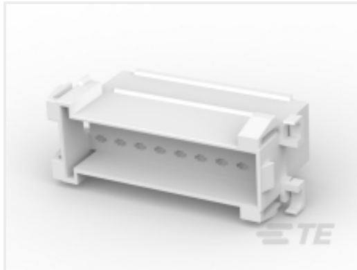
TE Part # 1-929505-6 FF FLA-STE-GEH2X 9P