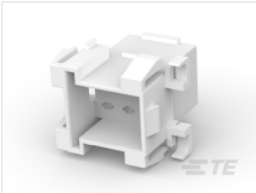
TE Part # 1-929505-2 TAB HSG .110 (2.8 MM) HSG TAB