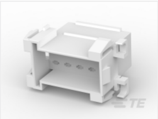
TE Part # 1-929505-4 TAB HSG .110 (2.8 MM) HSG TAB