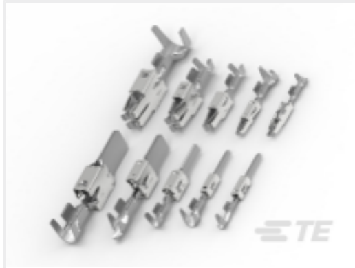
TE Part # CAT-T4827-T273 TIMER, RECEPTACLE AND TAB