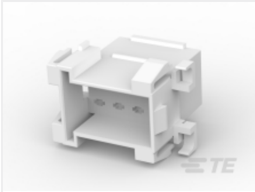
TE Part # 1-929505-3 TAB HSG .110 (2.8 MM) HSG TAB