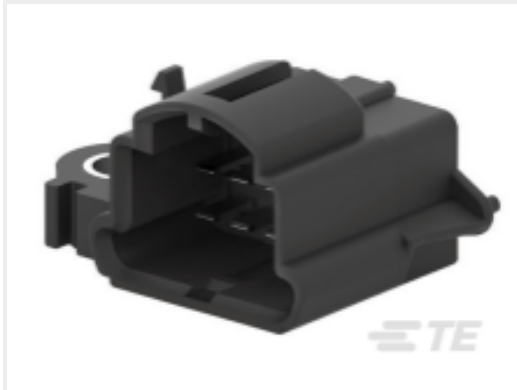
TE Part # CAT-LMPH9507 Low & Medium Power Header