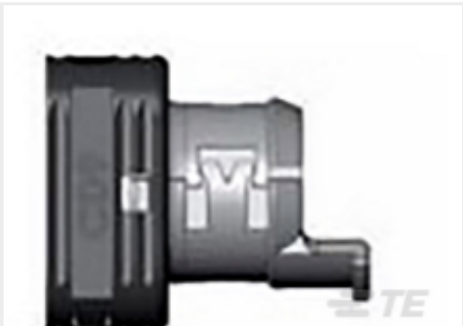
TE Part #ZPF000000000137993 787-8055-13M