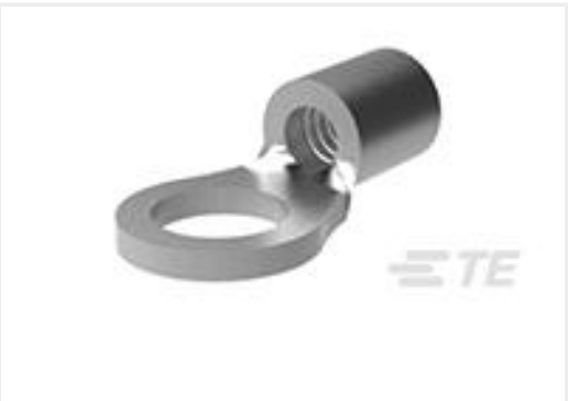
TE Part #34104 SOLIS R 22-16 COMM 22-18 MIL 4