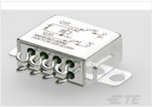
TE Part #4-1617786-6 FCB-205-0215L=M83536/2-015L