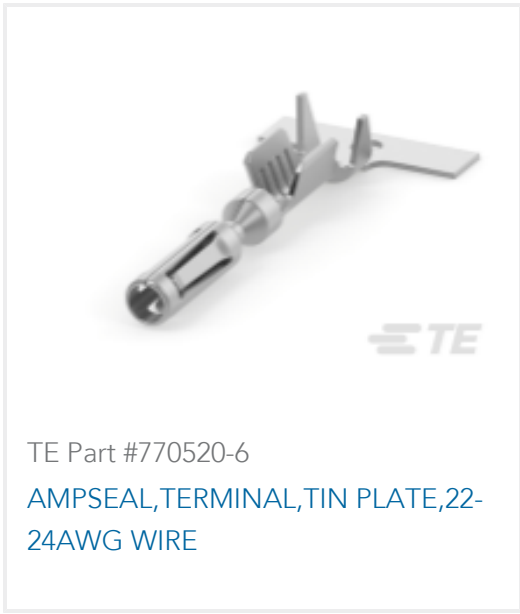
TE Part #770520-6 AMPSEAL,TERMINAL,TIN PLATE,22- 24AWG WIRE