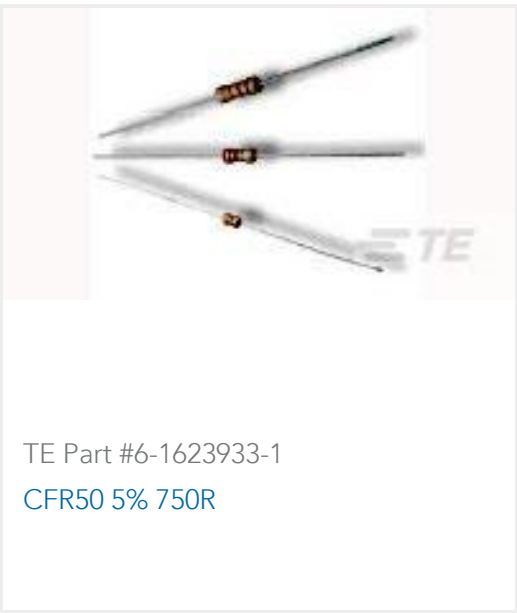
TE Part #6-1623933-1 CFR50 5% 750R