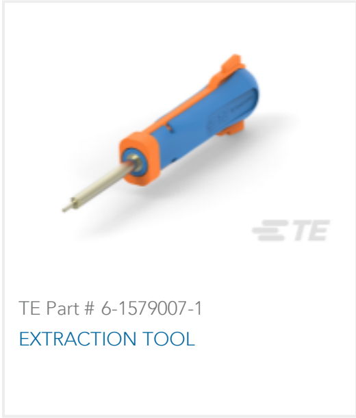
TE Part # 6-1579007-1 EXTRACTION TOOL