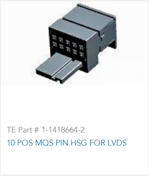
TE Part # 1-1418664-2 10 POS MQS PIN HSG FOR LVDS