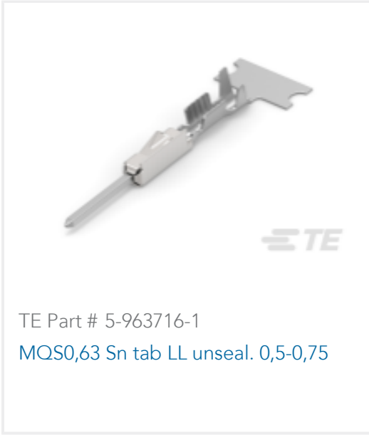
TE Part # 5-963716-1 MQS0,63 Sn tab LL unseal. 0,5-0,75