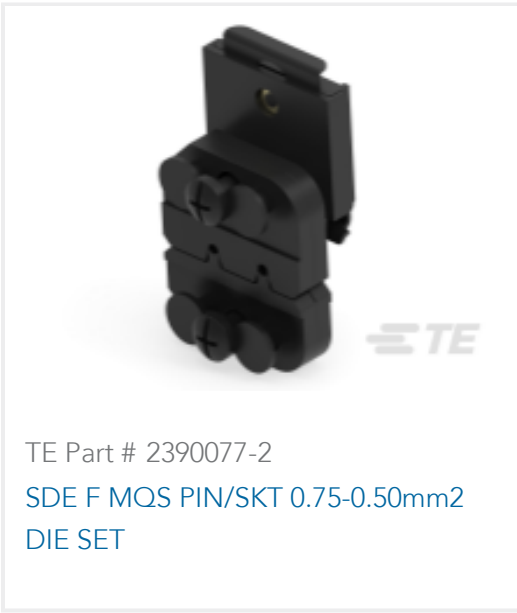
TE Part # 2390077-2 SDE F MQS PIN/SKT 0.75-0.50mm2 DIE SET