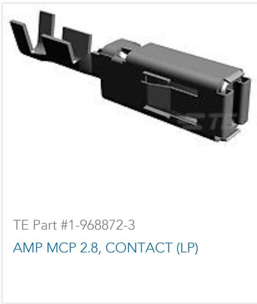
TE Part #1-968872-3 AMP MCP 2.8, CONTACT (LP)