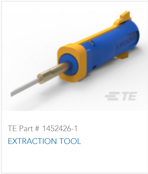
TE Part # 1452426-1 EXTRACTION TOOL