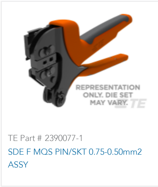
TE Part # 2390077-1 SDE F MQS PIN/SKT 0.75-0.50mm2 ASSY