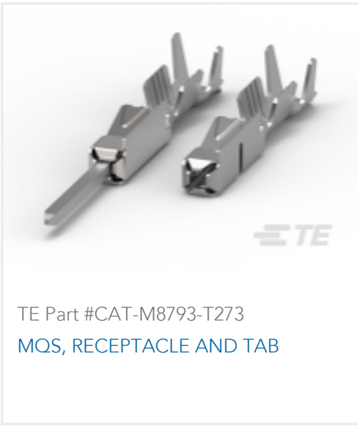
TE Part #CAT-M8793-T273 MQS, RECEPTACLE AND TAB