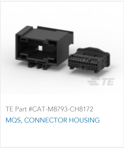
TE Part #CAT-M8793-CH8172 MQS, CONNECTOR HOUSING