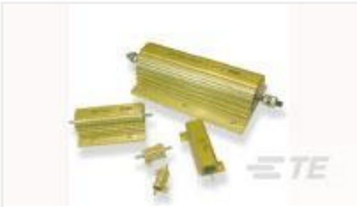
TE Part #2-1625999-2 HSC100 27R 5%