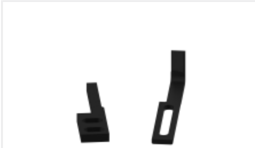
TE Part #2119561-1 BRACKET, STRIPPER, END FEED