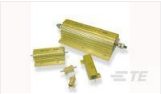
TE Part #1625999-1 HSC100 100R 5%