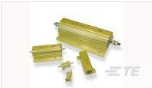
TE Part #2-1625999-0 HSC100 22R 5%