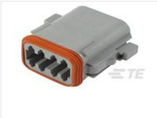
TE Part #DT06-08SA-P012 PLG, 8P, GRY, N, SEAL RET, A