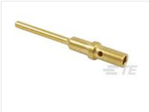
TE Part #0460-202-2031 PIN, SOLID, SIZE 20, 20AWG, AU