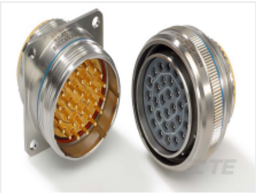
TE Part #ZPF000000000008035 983-1YE 10-06 PN