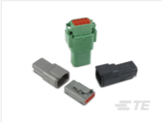
TE Part #CAT-D485-CH8172 DEUTSCH DTM Housings