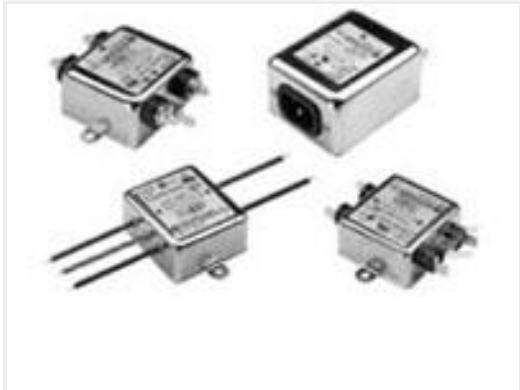
TE Part #1-6609028-7 20VK1=F7147 S0