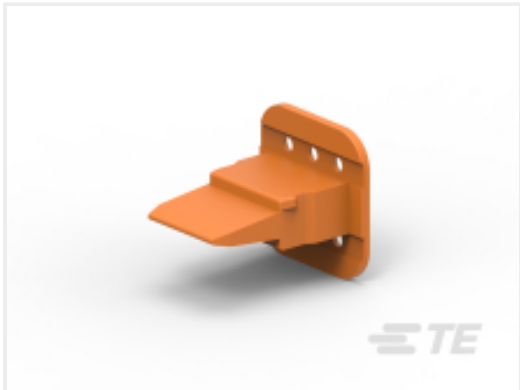
TE Part #W6S WEDGE LOCK, 6P, PLG, ORG, STD, DT