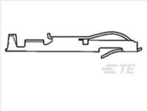
TE Part #583853-9 TWIN LF CONT IS 20-24 AU