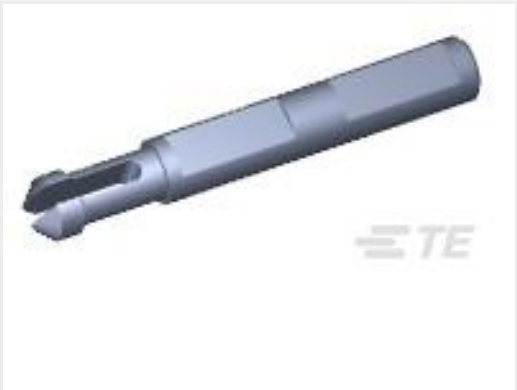
TE Part #770377-1 UMNL II KEYING PLUG