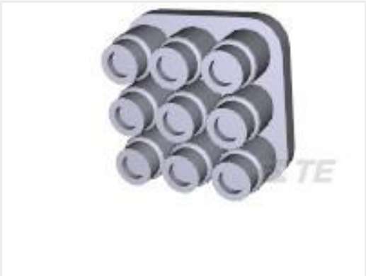
TE Part #794278-1 09P UMNL WIRE SEAL

Datasheets & Catalog Pages MATERIAL AND FINISH DETAILS