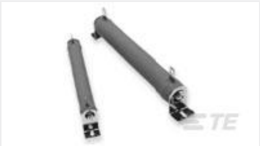
TE Part #3-1879453-7 TE 1000W 1K0 5% Bracket