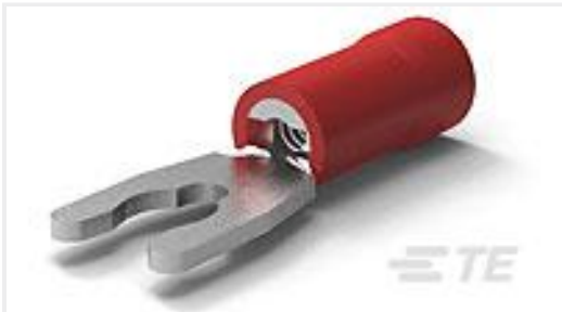
TE Part #52949-1 PG SPR SPD 22-16COMM 22-18MIL6