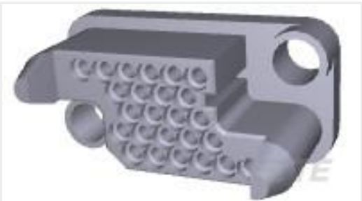
TE Part #211150-1 METRIMATE SKT HSG 25P