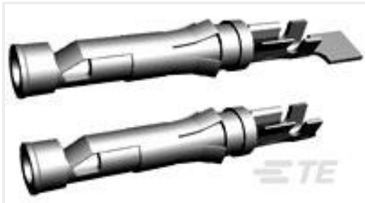
TE Part #66101-2 III+ SKT,18-16,TIN-LEAD,LP