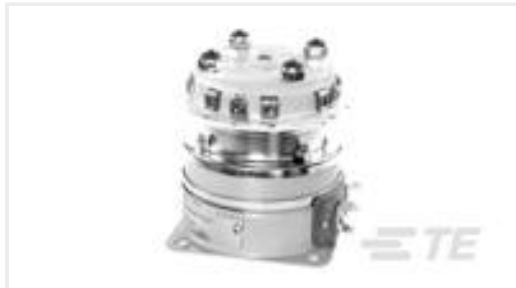
TE Part #9-1393139-2 MDR-67-2=MDR