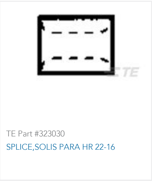
TE Part #323030 SPLICE,SOLIS PARA HR 22-16